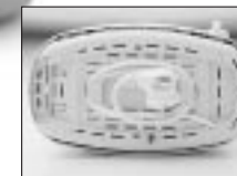
Tidy cord storage